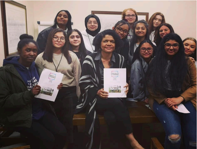
Parliament visit with Chi Onwurah

Change Maker Consultation Report http://www.projects4change.org/wp-content/uploads/2019/06/iWill-Change-Makers-Report-2019-Final.pdf