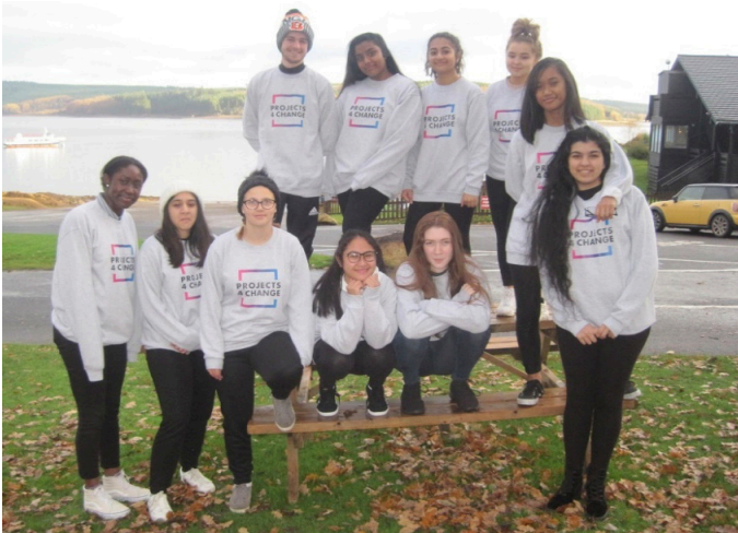
Training Residential at Calvert Trust

The Change Maker Volunteer programme recruits from across the city and works to amplify the voice of young people . The volunteers consult and act on youth issues helping to engage their peers in changing their communities for the better .