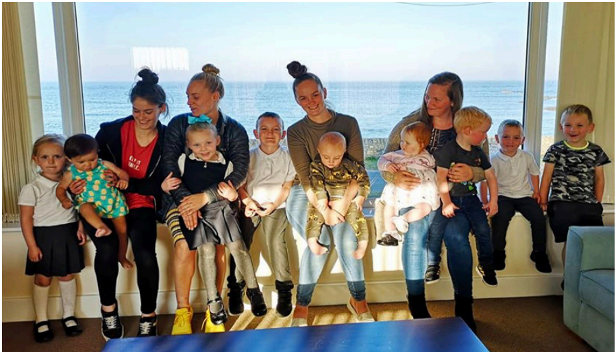
Young mums on their first residential in Beadnell